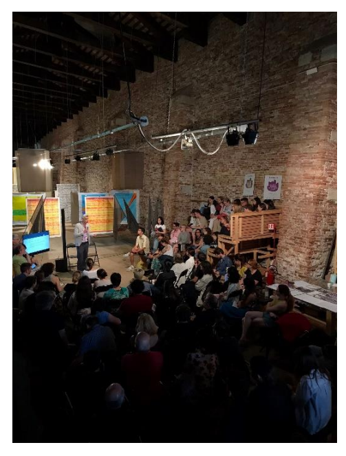
Figure 9: "BIENNALOCENE", Assembly at Sale Docks, June 8, 2023.

The consequent step in the implementation of the "Biennalocene" project took place on the 28<sup>th</sup> of October, when the document was presented to the public during a sit–in that took place in front of the gates of the Giardini of the XVIII Venice Architecture Biennale. The objective was to provoke the organization of a meeting with the management of the Biennale to discuss the adoption of the Charter and urge them to implement measures aligned with the Charter's demands, particularly aimed at improving the working conditions of their employees.