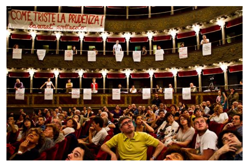
Figure 7: Teatro Valle Occupato, October 2014.