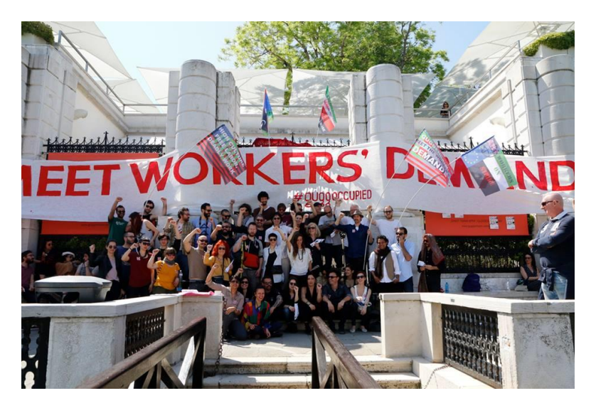
Figure 9: Gulf Labor protesters outside the Peggy Guggenheim Collection in Venice on May 8, 2015.

In 2015, for instance, they decided to occupy the Peggy Guggenheim Museum's terrace facing the Grand Canal to protest against the exploitation of migrant labourers from South East Asia during the construction of the foundation's Abu Dhabi branch.