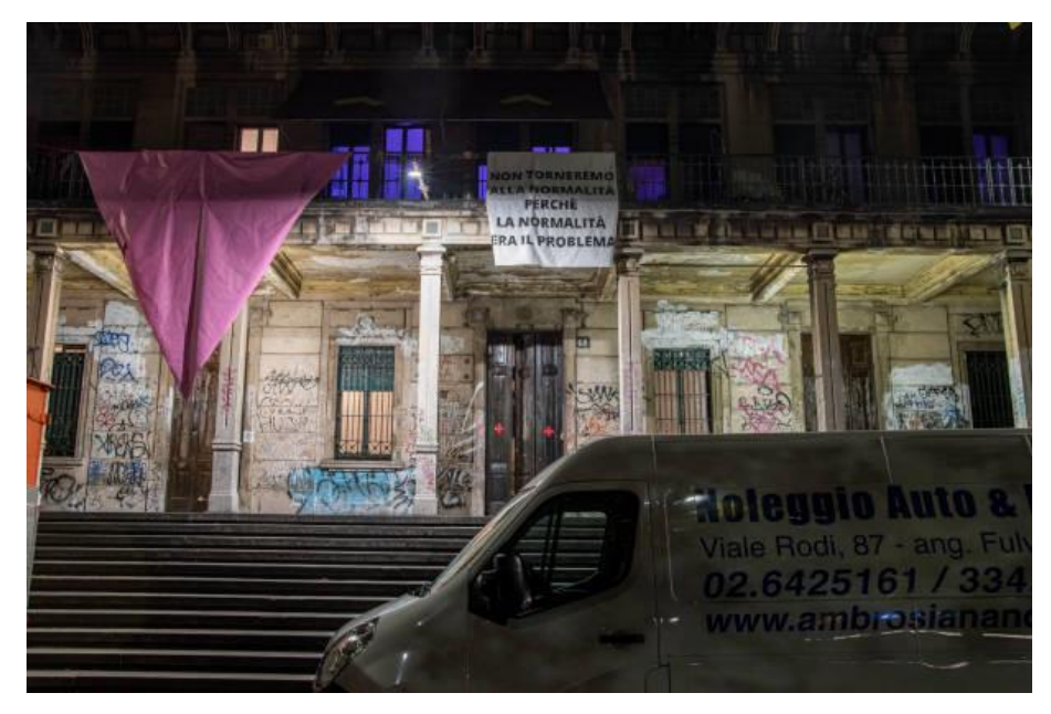
Figure 6: A sign on the entrance of Macao says "We will not go back to normality because normality was the problem", October 1, 2020 in Milan, Italy.

Macao was an independent activist cultural centre born from the desire of a group of art workers to initiate a reflection on the concept of culture as a common good, that could unite theory and practice (Cossu, 2014). In 2011, the Art Workers group, backed by other similar Italian entities (including members of Sale Docks) and enjoying widespread citizen participation, ultimately identified a location for the establishment of Macao, after numerous temporary occupations of symbolic spaces throughout the city of Milan. They settled on a building that had remained abandoned for years, originally selected and designated for a redevelopment project that, nevertheless, was never implemented. After a decade of activity, the space was closed down in 2021 due to a confluence of factors, including escalating pressures from the city's institutions and challenges arising from the COVID–19 pandemic.