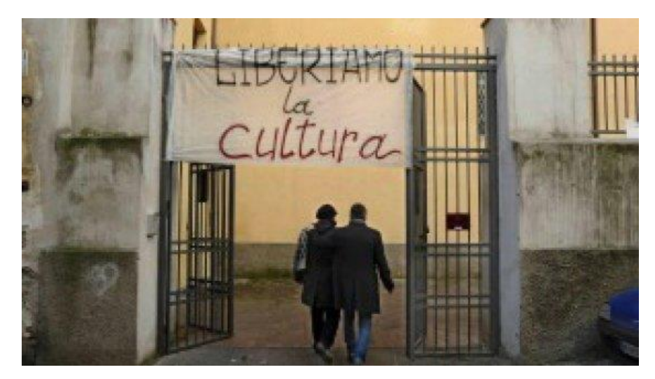
Figure 8: The entrance of Ex Asilo Filangeri in the first days after the occupation in March 2012.