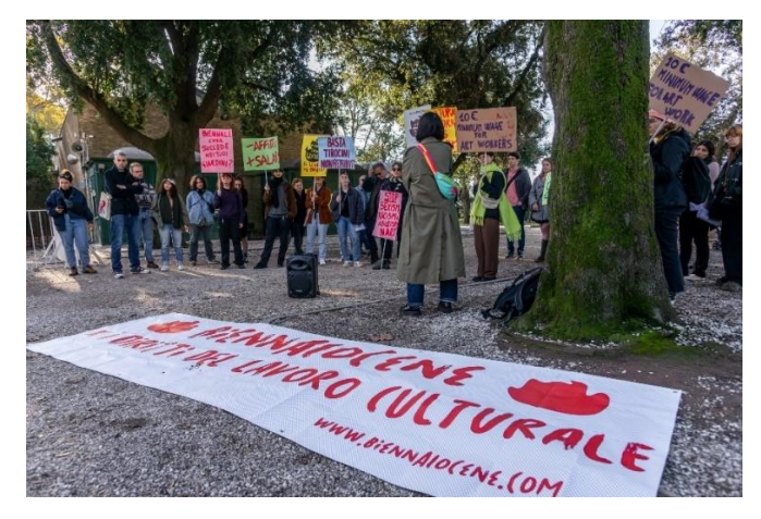
Figure 10: "BIENNALOCENE", Action at Giardini della Biennale, Octobre 28, 2023.