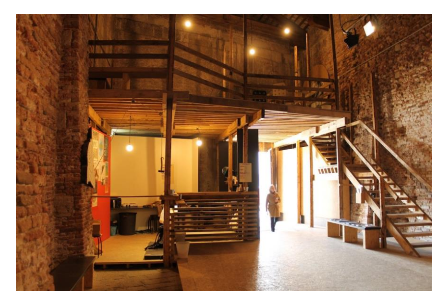
Figure 5: The entrace of the space of Sale Docks at Magazzini del Sale and the mezzanine floor designed and by Thomas Kilpper and built in collaboration with ReBiennale.

neighbourhood, a group of activists, united by the shared experience of centri sociali , decided to occupy one of the abandoned warehouses owned at the time by the Municipality of Venice. The central positioning of the space within what was then designated as the "art kilometre", or, as Marco Baravalle termed it, an actual "museum district", constituted a key factor influencing the selection of the site by the group of activists who took part in the occupation. These definitions referred to the notable concentration of art spaces situated between the museum Gallerie dell'Accademia and Punta della Dogana. The latter, acquired in 2005 by the French magnate Francois Pinault, served as a venue to showcase part of his prestigious collection of contemporary art, along with hosting internationally acclaimed temporary exhibitions. In addition, in the adjacent building to Sale Docks, within the same complex, Fondazione Vedova (designed by Renzo Piano) was inaugurated in 2009.