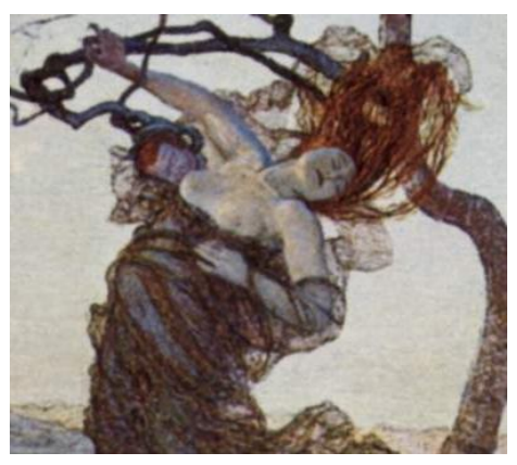
Figure 3 Giovanni Segantini, The Evil Mothers83