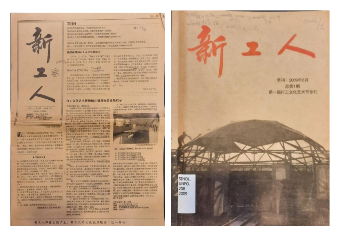
Figure 5 - The first issues of Xin gongren as a tabloid (left) and journal (right), with Leiden University seal or tag.

All the aforementioned publications were strictly "for internal distribution" (neibu jiaoliu 内部交流), a caption used to avoid political attention, or, more often, financial and bureaucratic problems linked to publishing rules. A publication "for internal distribution" comes without a book number, the commercial identifier assigned to a publication to make it unique, in possession of a copyright, and legally marketable. In theory, then, is not meant to be circulated beyond the group or circle that produces it, although that is almost never the case. However, in 2008 the Home also started an officially public paper with the Picun village committee, called Picun 皮村, a monthly tabloid inaugurated by Xu Duo's interview to Zhang Song 张松, the secretary of the Picun party branch. The paper published general news, but it also gave ample room to the activities of the Art Troupe, workers' stories (and occasional poetry), as well as useful information, such as about the provisions of the newly-approved Labour Contract Law. It was essentially another form of the policy of alliances made possible by the Art Troupe's nonconflictual approach.