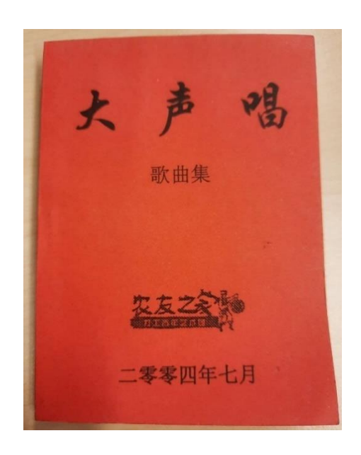
Figure 1 - The "Dasheng chang" booklet.

As will become evident throughout the chapter, the goal of producing a culture that migrant workers could claim as their own—proclaimed her with boastful grandiloquence—has remained the fil rouge of all the activities carried out by the troupe (and its spin-offs) ever since, although it has evolved and has been perfected along different lines.