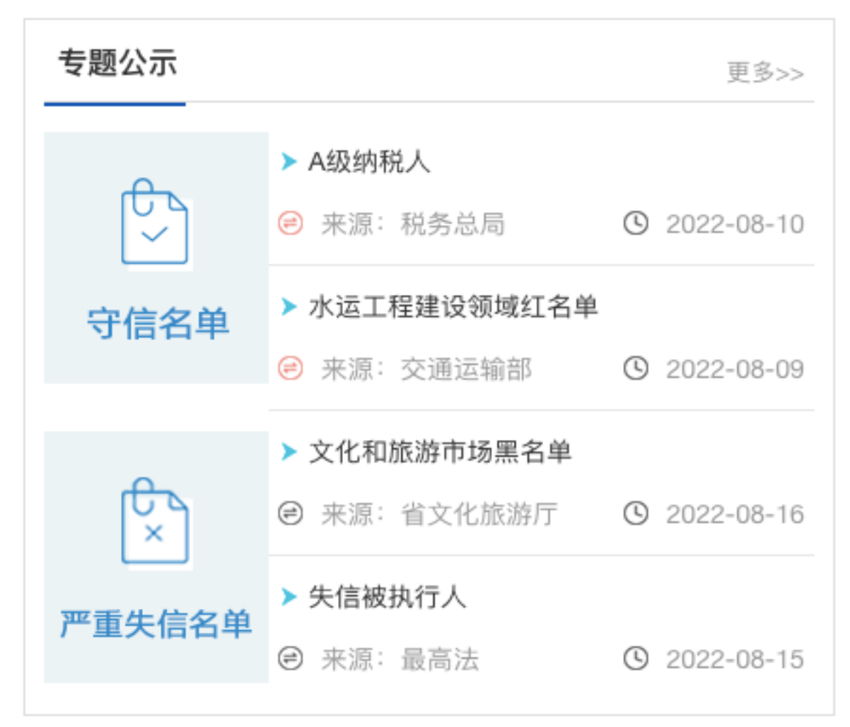
Figure 5: Redlists and Blacklists in the Credit Zhejiang Website.

From a cursory glance to the homepage, the two websites appear similar, even if not identical. Comparing figure 4 to figure 2, we can see that most of the basic functions are the same. However, when we scroll down, we find the first notable difference (figure 5): on the Credit Zhejiang platform it is possible to consult redlists and blacklists. The redlists and blacklists on the Credit Zhejiang platform are divided into national