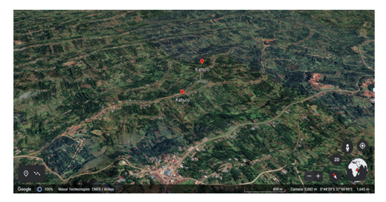
Figure 1. A map of Kahuro sub-county

Kahuro is a sub-county of Muranga County in the Central region of Kenya standing at an average elevation of 1645 metres a.s.l. The area is known for its fertile soils suitable for agricultural crop and livestock production which is enhanced by a good climate (Jätzold, 1987). The area experiences March to May long rains while the short rains are experienced from October to November (Jätzold, 1987). Farming is the main economic activity in this area being favored by the fertile soils coupled with the good climate. Farmers primarily grow food crops including Zea mays, Musa paradisiaca, Phaseolus vulgaris, Maranta arundinacea, Lopmoea batatas, and Cucurbita spp. among other crops. Camellia sinensis and Coffea spp. form part of the cash crops grown in the area while Persea americana and macadamia are emerging crops. Kahuro sub-county has an estimated population of over 80,000 according to the 2019 Kenya Population and Housing Census. Further, the average household size is estimated at 3 people.