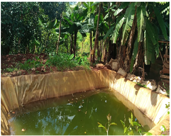
Figure 5. Pictures of water harvesting structures for irrigation purposes in Kahuro

Farmers who posted declining crop yields pointed out that the unreliability of rainfall in distribution, amount, and timeliness has contributed to reducing yields. In addition, soil fertility has declined with fertilizers and other farm inputs becoming expensive. Further, the interviewees indicated that the emergence of new pests and diseases such as Fall Armyworms, MLND, as well as the advent of desert locusts have negatively impacted crop yields.