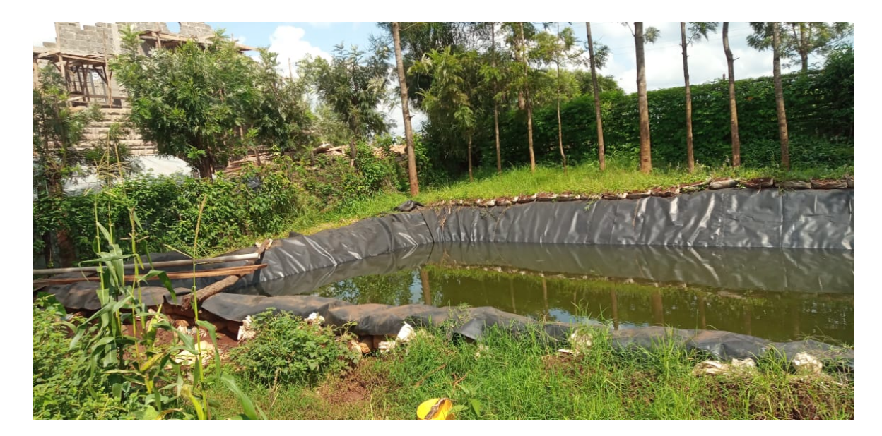
Figure 3. Crop production land used for construction of rental and residential houses

size changes that were impacting food crop production. 10 farmers affirmed that their land under crop production had changed. These farmers pointed that the reasons for these changes were land subdivision, landslides, and destruction by wild animals. Additionally, 6 interviewees intimated that they have used up their productive land for construction of rental and residential houses. Farmer KH007 noted that: "Much of my productive land has been taken up by construction. I want to become a landlord with an assured monthly income rather than doing farming. The money I will get from rent will be used to buy food for my family". Farmer KH004 indicated that his land size had changed owing to landslides. He stated: "My land is very prone to landslides. In 2002 is when there was the first landslide on my land. 13 respondents noted that their land under crop production had increased. The increase was attributed to the leasing of land from other farmers which in turn was a result of continued land subdivision. Farmer noted KH016 stated that: "We divided our father's land amongst ourselves which led me to lease land from neighbors so that I can produce enough food for my family". 9 farmers reported that their land under crop production had not changed.