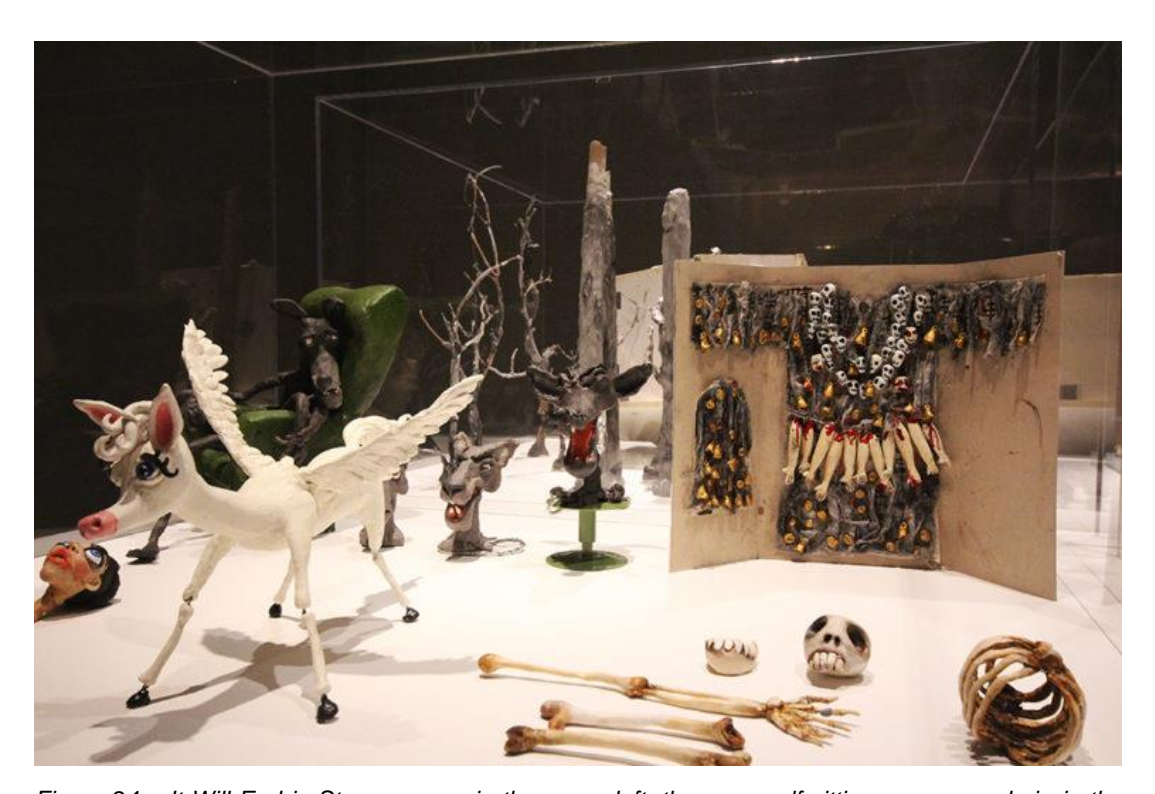
Figure 24 – It Will End in Stars props – in the upper-left, the grey wolf sitting on an armchair; in the upper-right, the sculpted woman's 'clothing' made of bones and bloody arms. In the bottom-left, the woman's head and a winged horse introduced in the kaleidoscopic scenes; in the bottom-right, the skeleton parts of the sculpted woman and the skull inserted in the wolf's hut at the beginning of the experience.

universe – where each environment does not only represent a physical place but also a psychological space imbued with primal anxieties, or they can just stay and explore only one of the sub-plots presented. The visual nature of virtual reality perfectly fits with Djurberg and Berg's adult fairy-tale narrative based on desire and guilt, animality and humanity, pulsations and repression, the known and the unknown, the visible and the unconscious. Animals, like the wolf, personify perversion and bestiality while the grotesque sculpted figures, like the naked woman, symbolise the repressed and hidden part, all accompanied by electronic and psychedelic soundscapes.