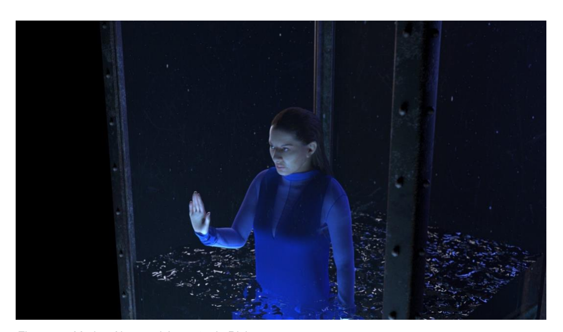
Figure 5 – Marina Abramovic's avatar in Rising

The user's interaction with the narrative elements and characters of the virtual experience is built thanks to an interplay of viewpoints and actions, which contribute to the definition of the artwork through the decisions that are made. For example, in Rising the users are able to interact with Marina Abramovic's avatar imprisoned in a glass cage filling with water and are requested to make an ethical choice on whether to save the artist from drowning.