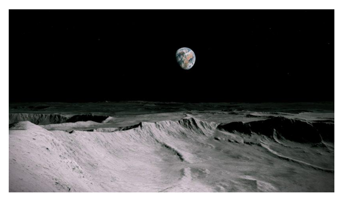
Figure 20 - the user's view of the Earth from the Moon's surface

Once again, as in the Space Explorers Series , this virtual reality piece explores the outer space and in particular the Moon's surface. It is the product of the collaboration between artist and sculptor Antony Gormley and Yale astrophysicist Priyamvada Natarajan, and it uses real data gathered by NASA's Lunar Reconnaissance Orbiter (LRO) to map an interactive journey from Earth, through the atmosphere and stratosphere, to the Moon and ultimately the outer space. To produce the perceptual sensation of looking at real size elements within the infinite scale of the universe, Acute Art employs a multi-scale modelling that efficaciously renders both the tiny objects as well as the massive elements such as the Sun. What Lunatick adds to Felix & Paul's documentary is the interactive experience, which allows the user to fly in all the directions through the earth and the sky and to feel the absence of gravity on the Moon's surface (see figure 20), hence the piece reveals itself to be extremely corporeal in spite of the lack of bodily presence.