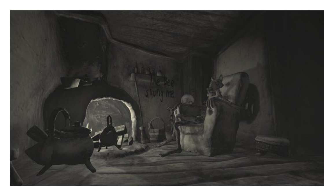
Figure 23 – The grey wolf in the hut at the beginning of the experience – It Will End In Stars

not completely readable as they followed his stream of consciousness. Some of the words pronounced act like a warning against something unknown to users: 'Let's keep memories, they make me company...I am scared'. At this point, they can explore the hut (see figure 23) and are captivated by some objects that serve as portals to teleport users into different dimensions, namely the subplots of the experience.