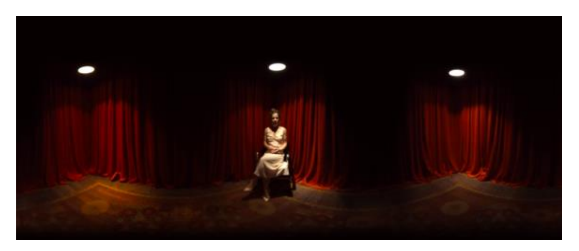
Figure 7 – physical setting of Believe Your Eyes transposed to the beginning of the virtual experience

materialised by the perceptual cues that help to stimulate users' senses so that they react and act throughout a double narrative. The sense of touch is what truly contributes to the construction of an immersive and allencompassing virtual environment and it is achieved thanks to the role of the theatrical performers who represent the junction point between the two worlds. The participants find themselves before a multisensory theatrical piece that challenges traditional storytelling convention. For instance, in Believe Your Eyes (see figure 7) the narrative develops itself through a non-chronological double narrative thread based on the trope of reality vs dream (which often stands for a nightmarish journey) blurring the lines between the physical and the digital.