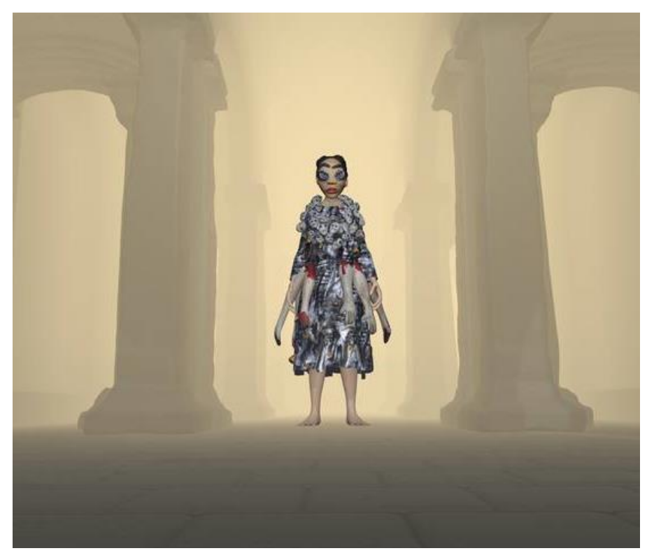
Figure 4 – female sculptural figure in It Will End in Stars

or modify the unfolding of the story. For instance, in the artwork It Will End In Stars , when the users find themselves in the wolf's hut, they are invited to tap objects that transport them into different unexplored spaces. One of the objects is represented by the miniature of a naked female sculpture locked in a cage that, once touched, allows the users to navigate into a new dimension where proportions are reversed, and they turn into a minuscule figure, which is confronted by the uncanny female sculpture now gigantic (see figure 4). It is important, however, to avoid an excessive number of variants and endings on a storyline so that the user does not feel disoriented and overwhelmed.