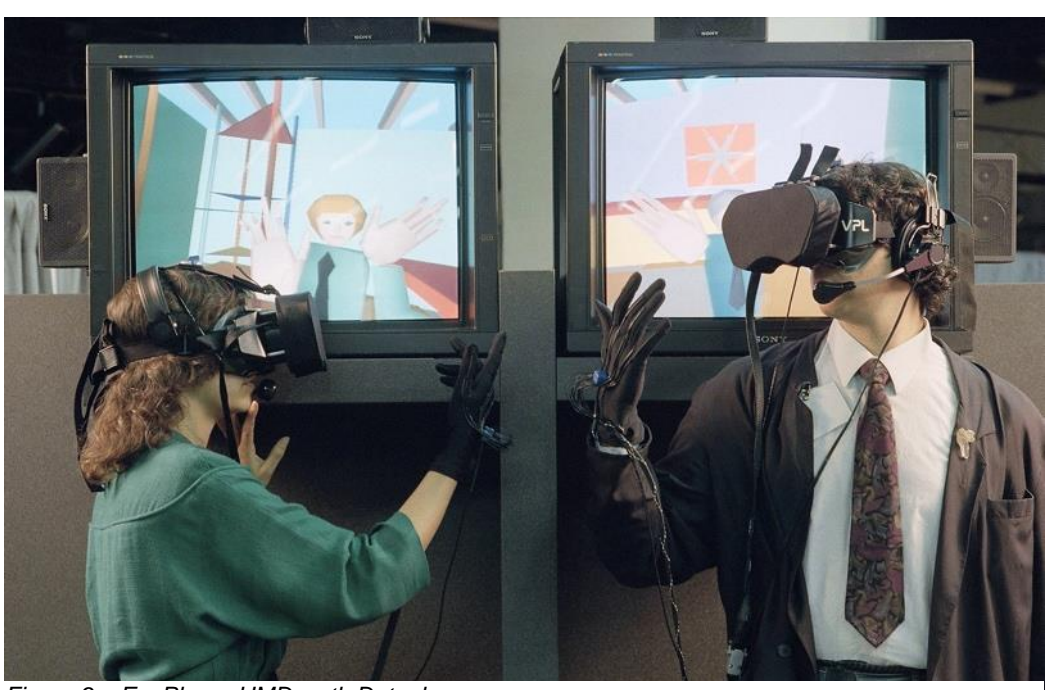
Figure 9 - EyePhone HMD woth Dataglove

Although Sutherland's device, called the Sword of Damocles due to its impending weight on the user's head, was basic and quite unrealistic in terms of graphic and interface, it led to significant studies towards more sophisticated applications of it. As a matter of fact, from that moment on research in the VR field produced other devices based on head-mounted displays, such as VCASS (1982), the Visually Coupled Airborne Systems Simulator, that is, a flight simulator, and the VIVED, the Virtual Visual Environment Display, created two years later. The very turning point was in the mid-eighties when the VPL, Visual Programming Languages, presented the well-known DataGlove (1985) and EyePhone HMD (Head-Mounted Display - 1988), which were major achievements in the field of virtual reality because they were used as hand- and head-trackers, and also because they were the first VR devices available on the market (see figure 9). Nonetheless, these early headsets were still heavy, expensive, and provided with cables and wires that restrained the possibility of action. Moreover, image quality was still poor and did not generate a truly immersive feeling on the viewer's part.