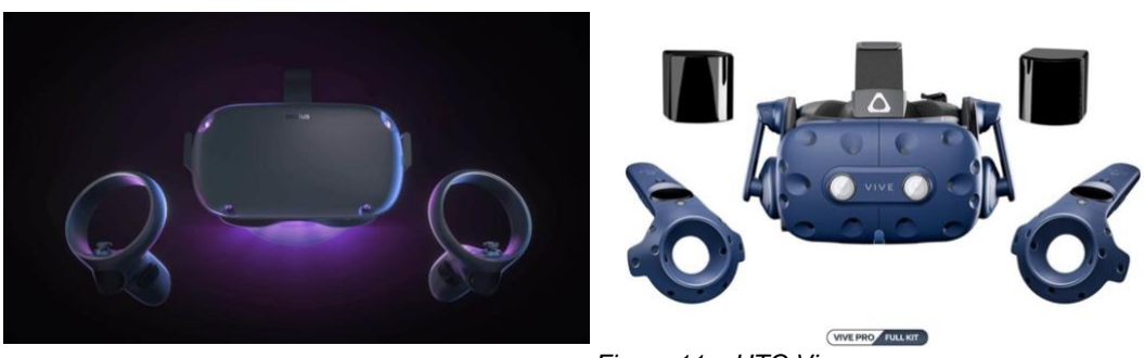
Figure 10 - Oculus Rift

From the 2010s onwards, there was a real breakthrough with regard to a series of ergonomic aspects that HMDs implemented: in fact, they became much lighter, hence more comfortable and easier to put on. They also became less expensive (although even today they are still not affordable to anyone) and wireless, thus allowing much more freedom of movement. Today, the most popular and commercially available virtual reality devices are equipped with a visor, that is, an HMD, and controllers. Since the acquisition by Facebook, Oculus has become one of the most famous brands in terms of virtual reality headset production and design and in the last few years has released different headset lines such as the Oculus Rift (figure 10) and the Oculus Quest. The other most known VR device is the HTC Vive (figure 11) produced by the Valve Corporation in collaboration with HTC.