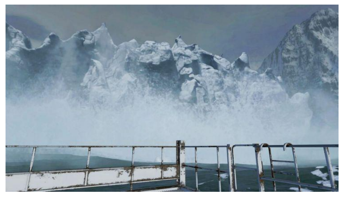
Figure 21 – Second part of the art experience Rising – melting polar ice caps (user's POV)

Some predictions say that, in just one hundred years, the human race will no longer exist on this planet. I want to address these issues. You are saving the human being and you are saving the planet, or you are not saving the planet and you make human being die, and the choice is only yours. (Abramović, 2018)