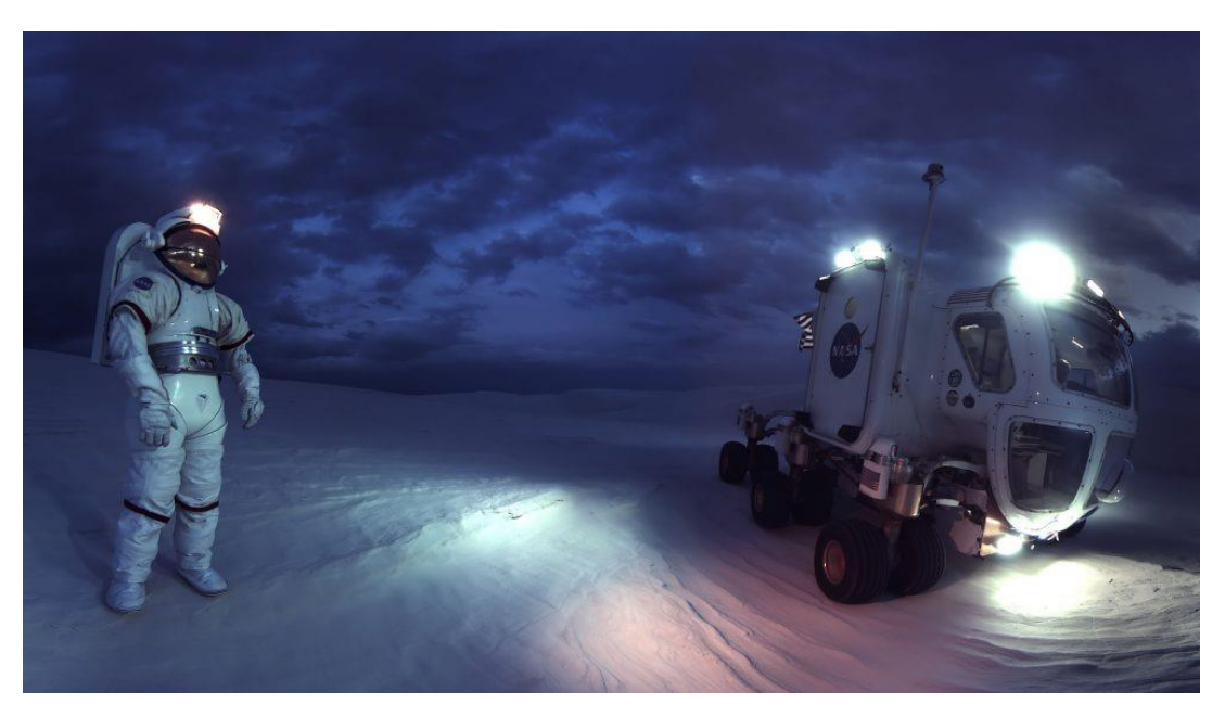
Figure 18 – A space exploration vehicle used for a run test in the desert