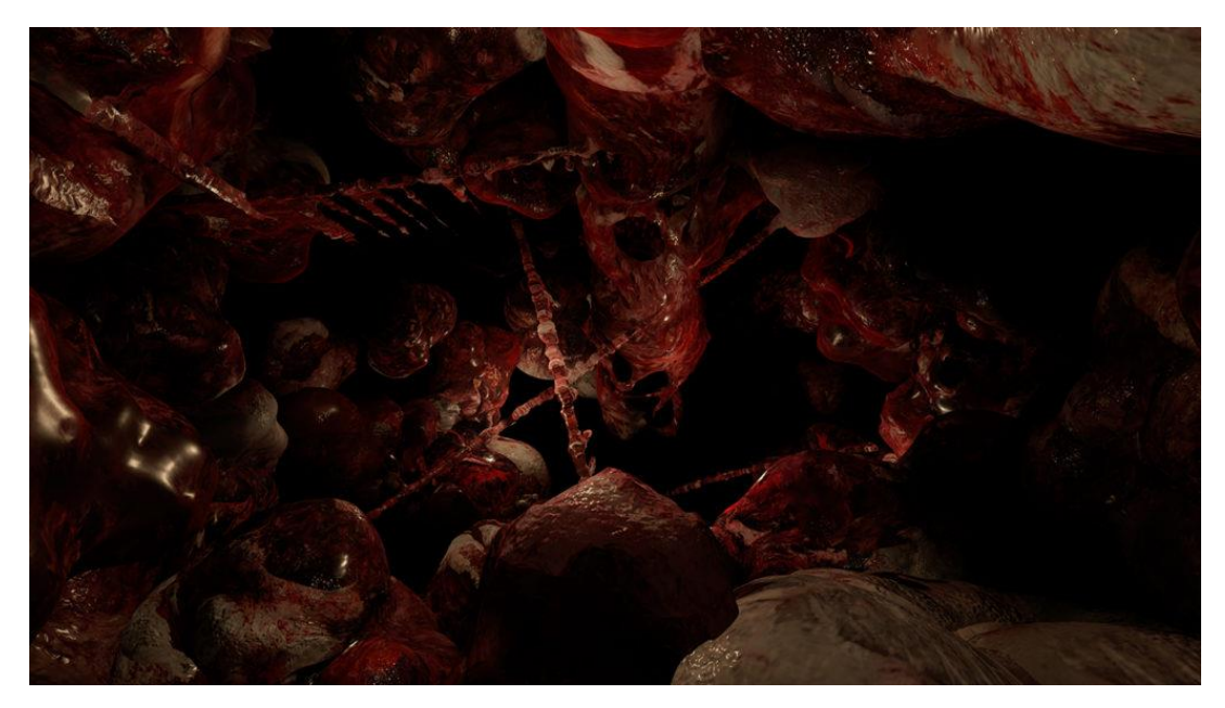
Figure 22 – The fleshy chasm at the beginning of the experience – 'falling into the human body'.

descension as well (see figure 22), both haptic and transcendent, into a pit made of flesh and muscles to discover the inner workings of the self.