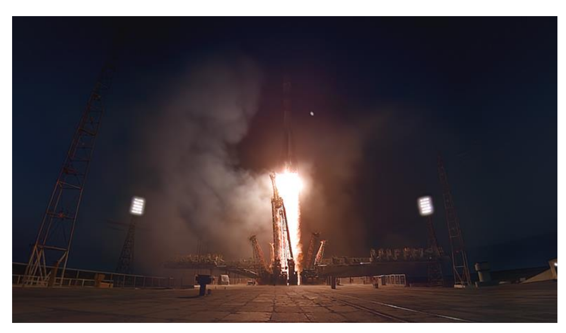
Figure 19 – Roscosmos space rocket launch (viewer's POV)

It is extremely thrilling for viewers to be next to the cosmonaut inside the rocket and to see all the training activities required to be prepared to that kind of missions, including the Centrifuge simulator, which in the VR piece is displayed during its activation and rotation at an increasing speed as though it almost came out from the screen. Then viewers find themselves within only six kilometers of the real Space X rocket launch (so close that part of the camera cover actually melted when capturing the rocket's departure).