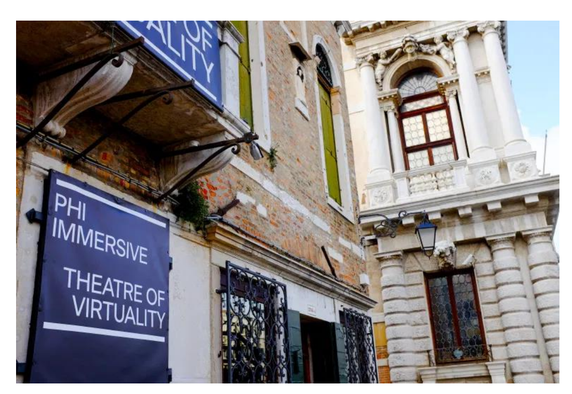
Figure 15 – Phi exhibition at Ca' Rezzonico Galleries for the 58th Venice Biennale

In 2019 for the 58<sup>th</sup> Venice Biennale, the Canadian centre decided to present 'Phi Immersive: Theatre of Virtuality', a six month-long exhibition at the Ca' Rezzonico Galleries centred on virtual reality pieces that explore the use of immersive technologies in the different domains of art, cinema and theatre. The conflation of the traditional with the innovative and the blurring between