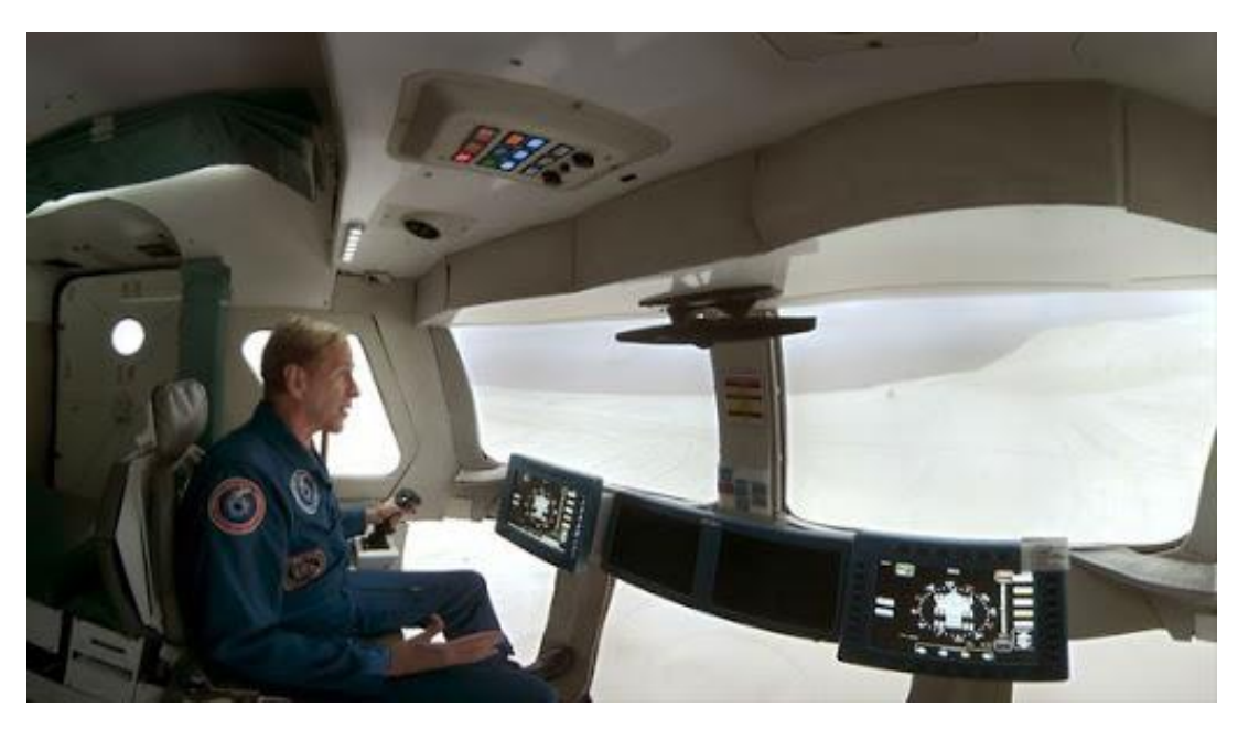
Figure 3 - cosmonaut Micheal Grenhart on a space exploration vehicle

very same scene of the story and takes them throughout the narration by using a panoramic perspective (which can be either internal or external). Users can also have an avatar through which they are able to move within the virtual environment and observe in detail all the scenes displayed. In this particular case, the viewers can experience the so called 'Swayze Effect' "describes the sensation of having no tangible relationship with [the] surroundings despite feeling present in the [virtual] world" (Burdette, 2015). This phenomenon is named after the actor Patrick Swayze's role in the wellknown film Ghost (1990) where he in fact plays the part of a ghost who struggles to be acknowledged from the other characters and the environment itself. It is a downside that could occur with the passive virtual reality storytelling approach since the viewer can see but it is prevented from interacting with the virtual dimension. In order to avoid the Swayze effect, it is fundamental to render the narration inclusive through the 'correction' of the virtual characters' behaviour so that they acknowledge the presence of the viewer. A way to achieve this inclusion is by addressing the characters' gaze to the spectator combining it with an approaching movement. For instance, in the cosmic documentary A New Dawn the viewer is introduced to first-hand space exploration carried out by Nasa's new generation of astronauts such as Jessica Meir, Jeanette Epps, Victor Glover.