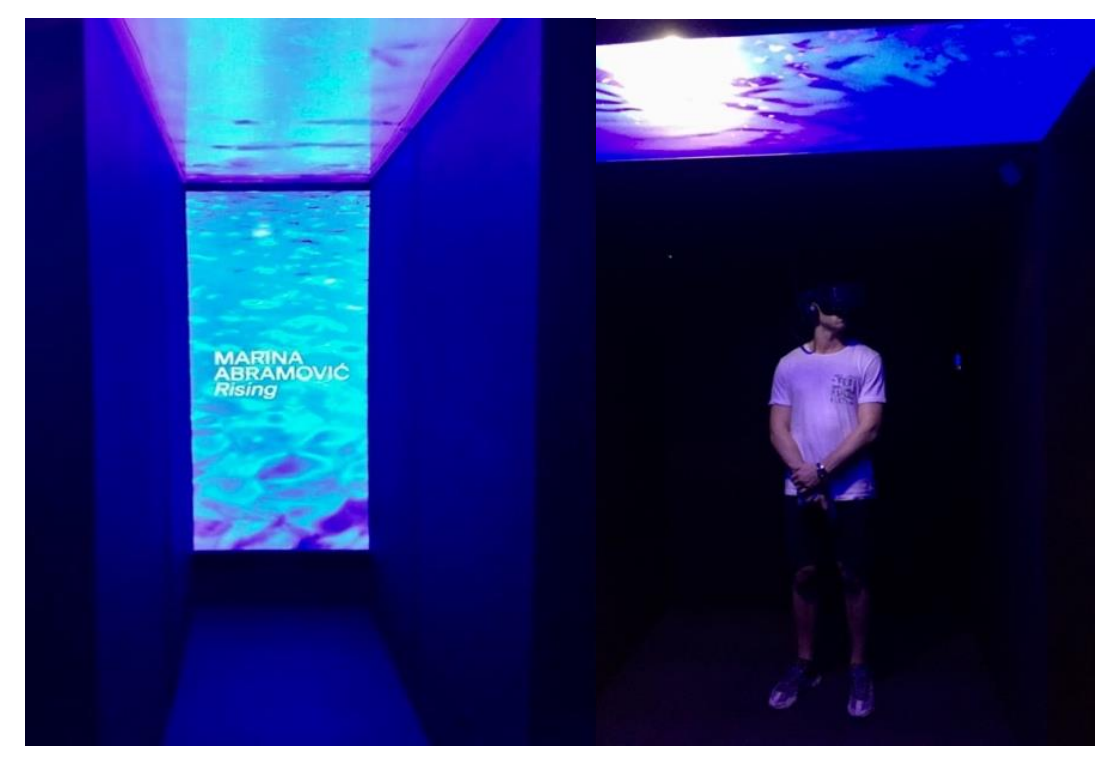
Figure 12 - watery setting for Marina Abramović's Rising at Gallerie Ca' Rezzonico (Venice)

structured around the element of water to recall the ocean and specifically to anticipate the theme of the experience, that is, the global sea levels rise.