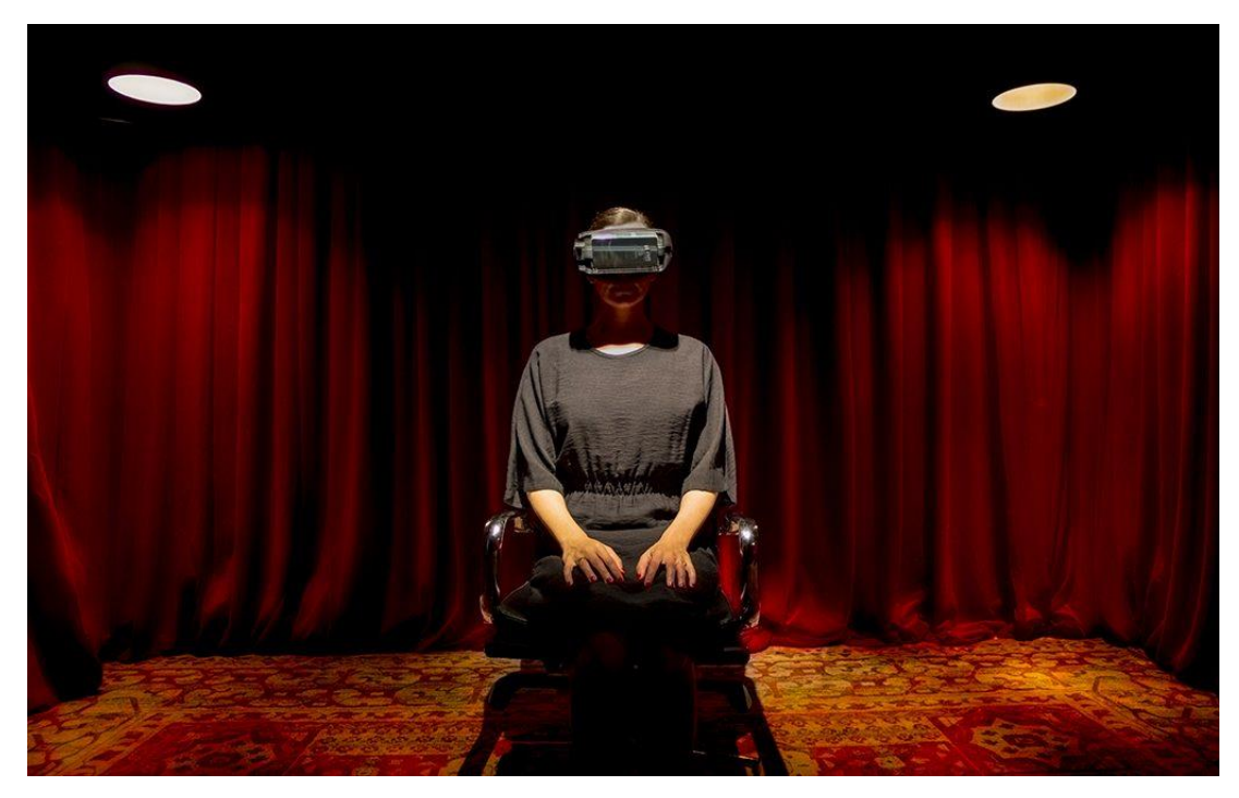
Figure 13 - Theatrical setting of Punchdrunk's Believe Your Eyes

the anticipation is double for it refers both to the visual and oral properties of narration. In the pre-experience the visitors receive hints at what they are going to be presented but do not fully grasp the meaning and the underlying theme until the very end of the piece when another actor appears in the physical world, outside the museum, playing the role of a passer-by tourist asking for directions and bewildering them with the final line 'believe in your dreams'.